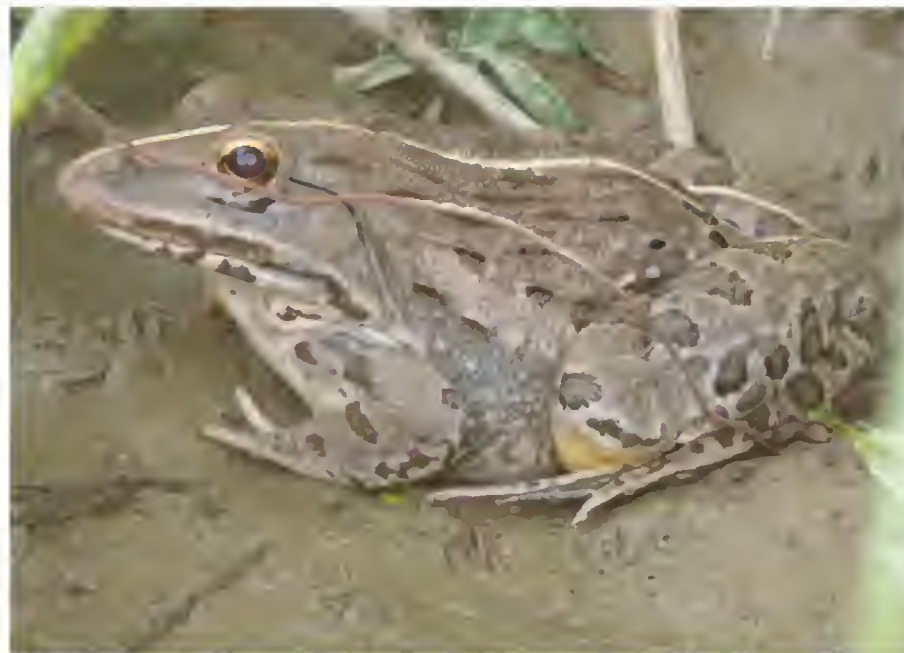
Fig. 2B. Hoplobatrachus tigerinus .